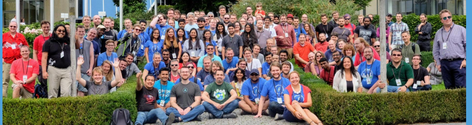
Group photo from Flock 2018 in Dresden, Germany

The Fedora Project envisions a world where everyone benefits from free and open source software built by inclusive, welcoming, and open-minded communities.