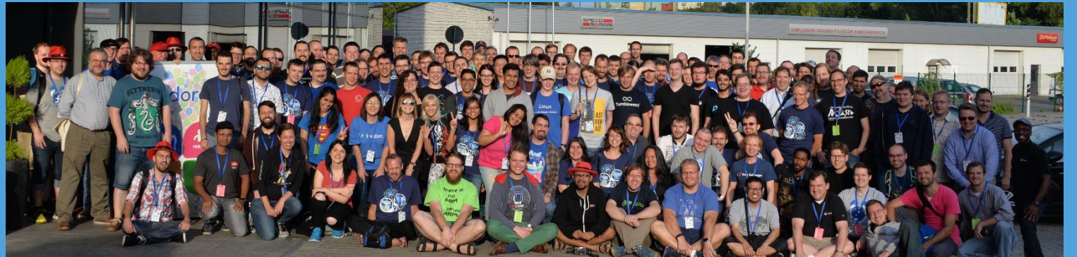
Group photo from Flock 2016 in Kraków, Poland